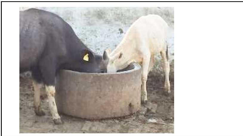
Pic: Sial chi liahna hmun