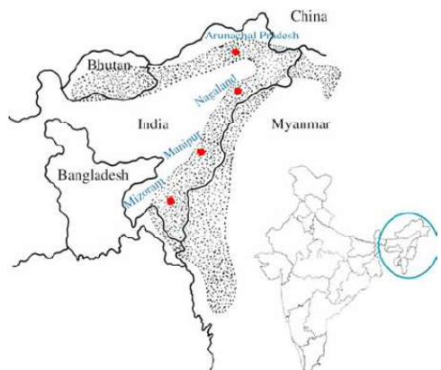
Fig: Sial kan hmuhna ram te