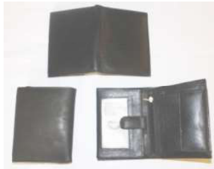
Fig: Sial vun atanga leather siamchhuah